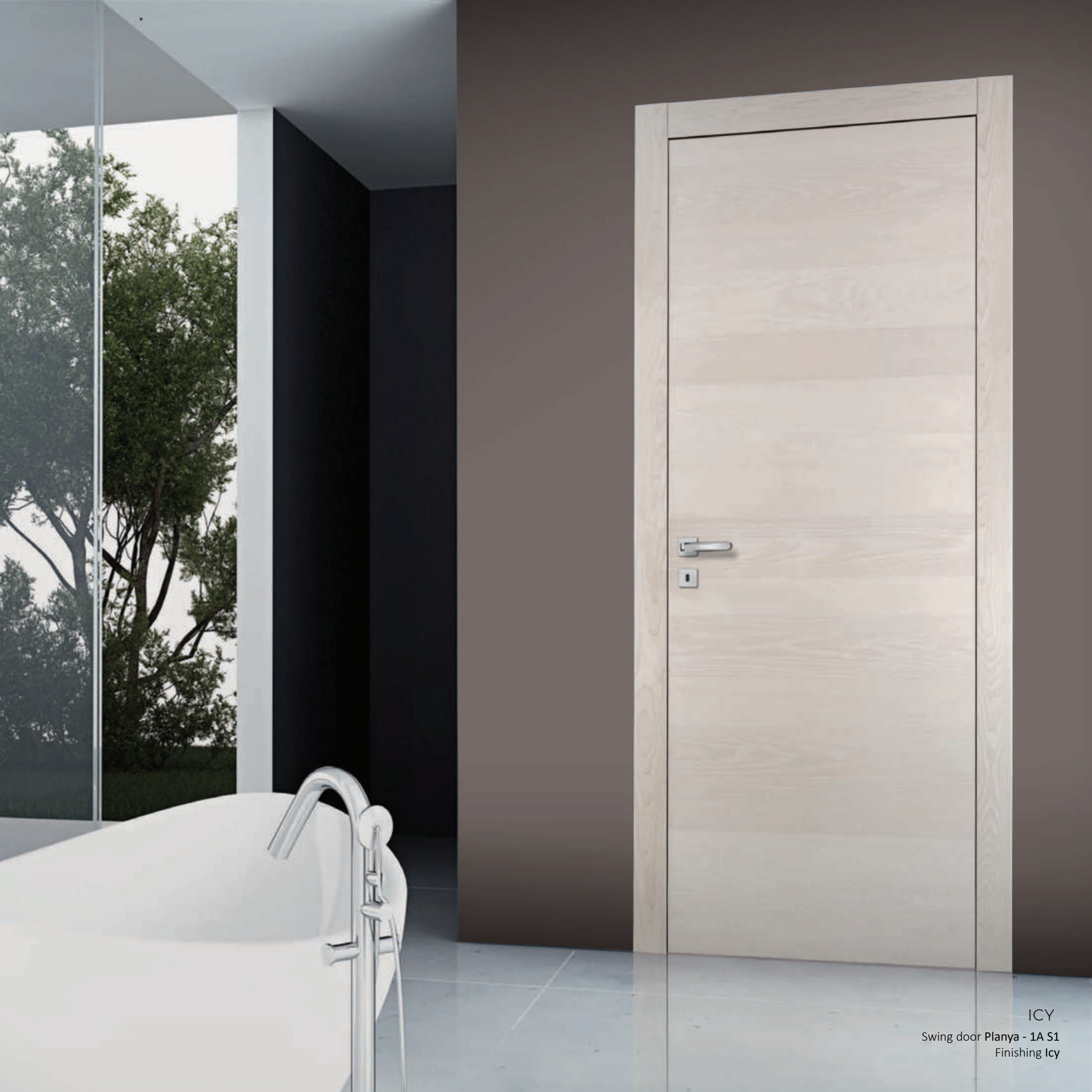
ICY Swing door Planya - 1A S1 Finishing Icy